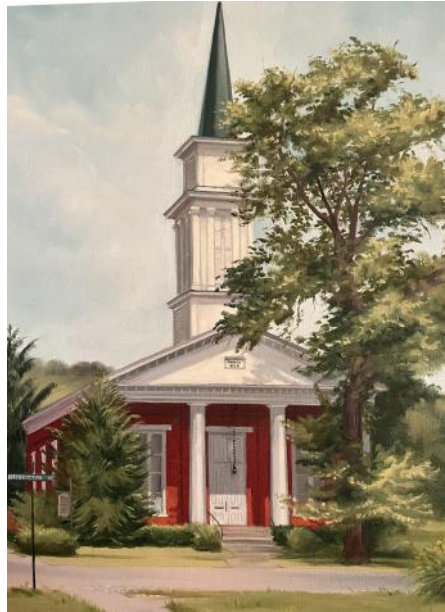
I was glad when they said to me, "Let us go to the house of the LORD!" (Psalm 122:1)

Beginning with Advent we look forward to deepening the sense that liturgy – a word meaning the work of the people – is shaping our congregation's life together, even as we have different voices in the pulpit week to week. We're open to your suggestions and plan to seek the guidance of the whole congregation in shaping our worship life together. Stay Tuned!